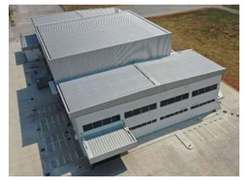
Exterior View of the Plant *Continued on page 2.

NIPPN defines overseas businesses as one of the focus fields in its FY2023-2027 medium-term targets, and aims to increase the ratio of international sales from around 3% in FY 2022 to 6% or higher in FY2027. This is the third overseas premix plant, following those in Thailand and China. The operation of this plant will further ensure NIPPN's initiatives to achieve its medium-term targets.